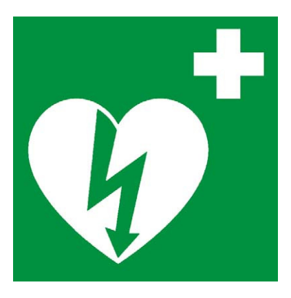
Figure 4 ILCOR universal AED sign.

a program, the community supervisors must assess factors such as adequate emplacement of the AED, based on previous incidence or population concentration studies; the training of a team in charge of monitoring and maintaining the devices; the training of people who probably will use the AEDs; and, if possible, identify those individual volunteers agreeing to use the device on the victims of cardiac arrest.