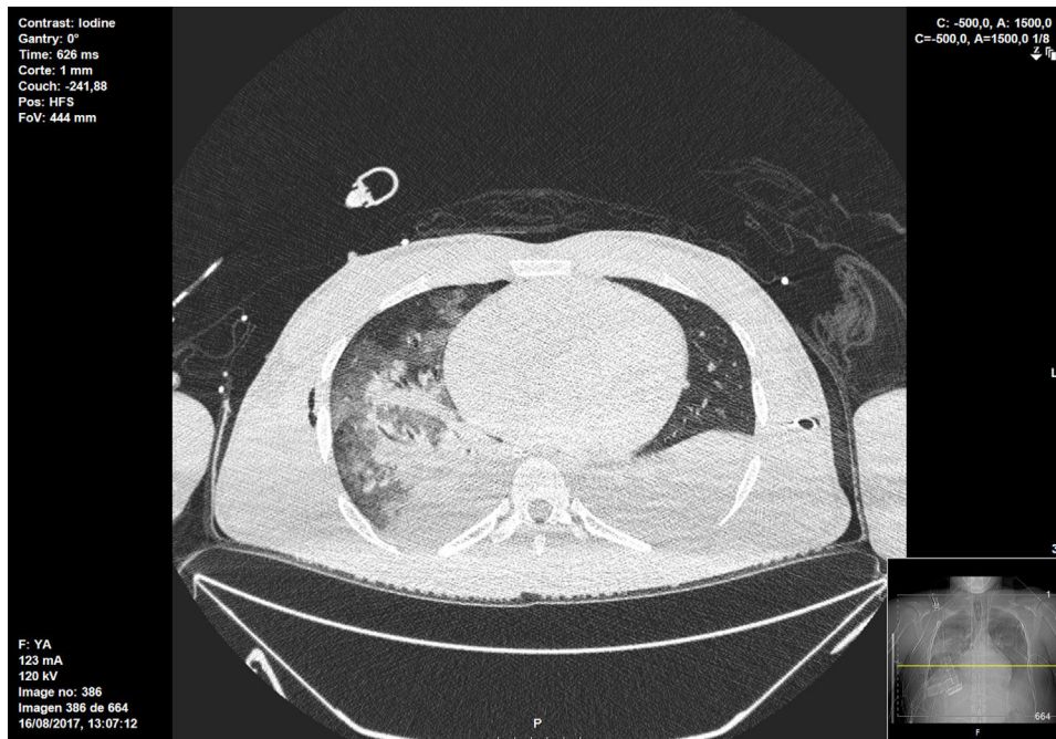
Figure 2 Thorax CT scan on day 2 showing severe lung infiltrates and atelectasis.

Biscotti 4 described two patients with severe BTI and intracranial bleeding who needed ECMO for ARDS. The circuit was anticoagulated with UFH with an aPTT target of 40–60 s. However, no patient experienced ICH or underwent surgery.