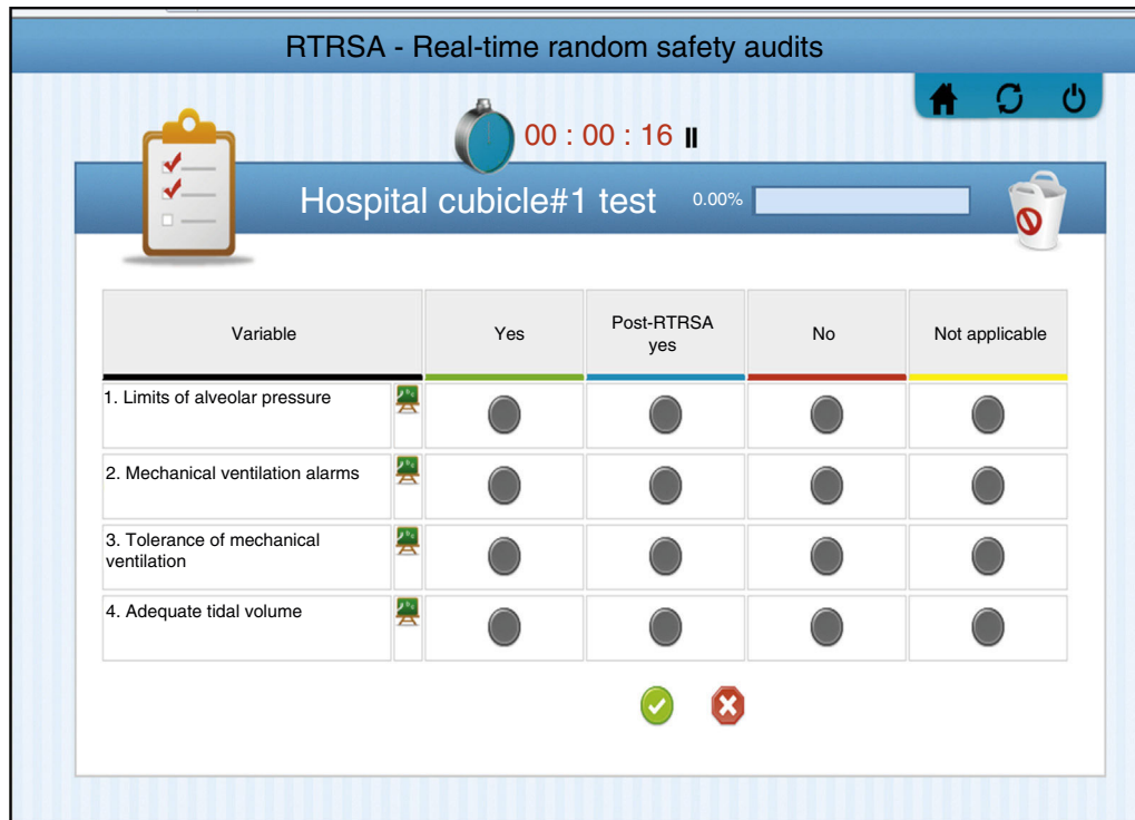
Figure 2 RTRSA web platform.

Measuring safety is one big challenge for the lack of standard definitions, because the exact incidence of incidents, or