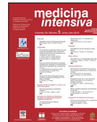
IMAGE IN INTENSIVE MEDICINE