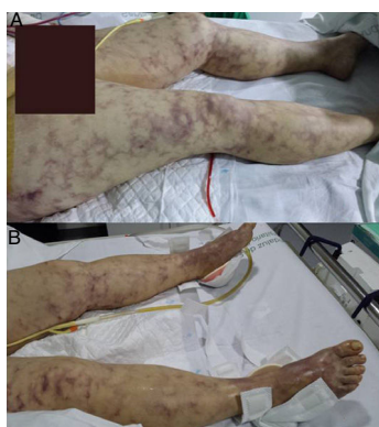
Figure 1 Image of livedo reticularis on the lower extremities, first 24 h of admission. Skin involvement comprising the upper abdomen, hips, buttocks and both feet, with "blue toes". The image at top shows drainage after emergency laparotomy with splenectomy, gastrectomy and pancreatectomy due to multivisceral infarcts.

b Departamento de Patología, Hospital Universitario Reina Sofía, Córdoba, Spain