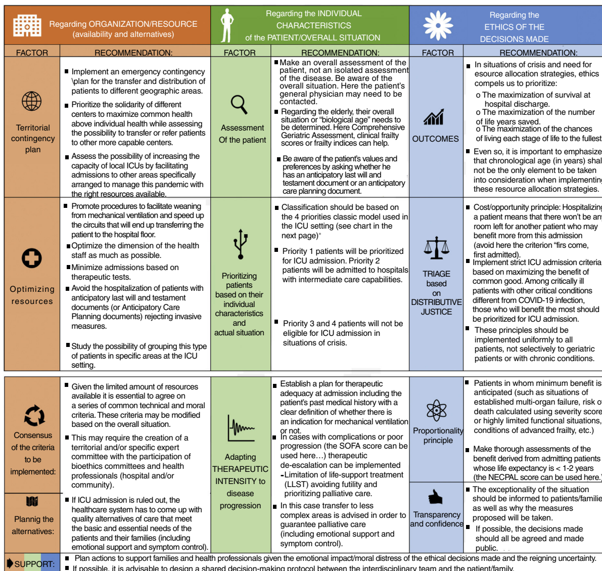
Figure 2 General recommendations on difficult moral decisions and adequacy between healthcare intensity/allocation to intensive care units in exceptional situations of crisis.

demographic related situations of crisis at the ICU setting. Although there may be some limitations associated with how fast it was designed and developed, the 3-step methodology used gave rise to an organized and rigorous proposal.