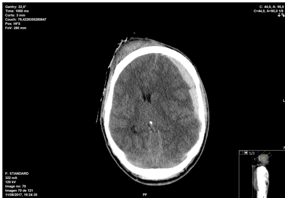
Figure 1 CT scan showing hemispheric subdural hematoma with middle line shift.

25. He was intubated and transferred to our hospital; initial CT scan showed temporal bone fracture and hemispheric subdural hematoma with middle line shift (12 mm) and signs of uncal herniation (Fig. 1).