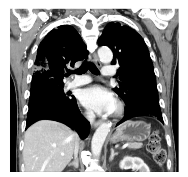
Figure 2 Figure 3

A 78-year-old bedridden man was admitted for presumed aspiration pneumonia with a chest radiograph showing a patchy opacity in the right upper lung zone (Fig. 1), with the presentation of fever and dyspnea. An urgent CAT scan revealed a wedge-shaped opacity in the right upper lobe (Fig. 2) and filling defects in the distal right main pulmonary artery (Fig. 3), confirming the diagnosis of pulmonary embolism with distal pulmonary infarction (Hampton's hump). Further examination revealed a deep vein thrombosis involving both legs. He was successfully treated with anticoagulant therapy.