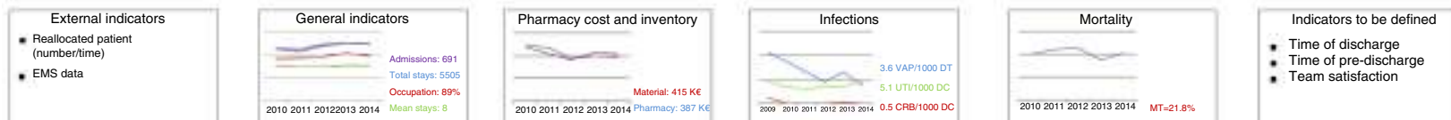
Figure 1 Panel showing the value stream map of the critical patients process. The panel is divided into different parts: the critical patient process is shown at top, while critical patient flow with the updated actual data are shown at bottom. The three projects developed in the period of the study are indicated, with details provided in the text. Finally, the considered health indicators of the critical patients in the ICU are shown.