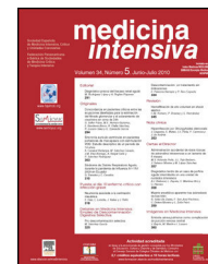
IMAGE IN INTENSIVE MEDICINE