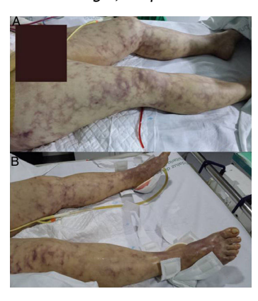
Figure 1 Image of livedo reticularis on the lower extremities, first 24h of admission. Skin involvement comprising the upper abdomen, hips, buttocks and both feet, with "blue toes". The image at top shows drainage after emergency laparotomy with splenectomy, gastrectomy and pancreatectomy due to multivisceral infarcts.