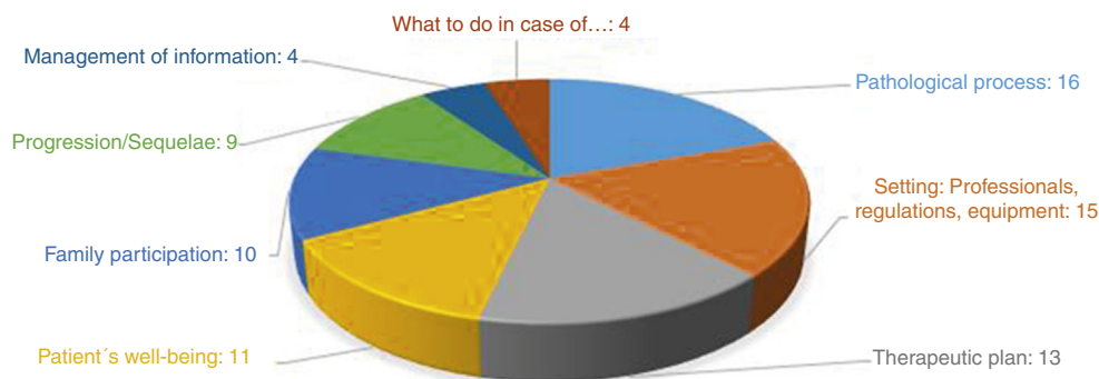
Figure 1 Categories within the “final questionnaire”. The 82 questions were grouped into 8 different categories. The name of each category is followed by the number of questions contained in each category.