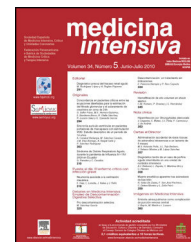
IMAGE IN INTENSIVE MEDICINE