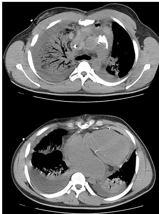
Figure 1 Computed tomography scan: alveolar consolidation at the level of the right upper lobe of the lung and moderate mediastinal hematoma.

Acquired pulmonary vein stenosis after cardiovascular surgery is a rare yet not serious complication. We hereby present the case of one patient who developed a complete occlusion of the right upper pulmonary vein during