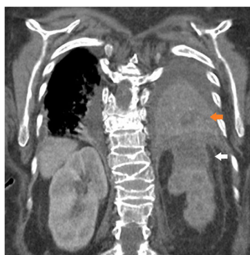
Figure 2 Renal abscess and abscessified pneumonia.