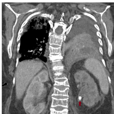
Figure 1 Left renoureteral colic.