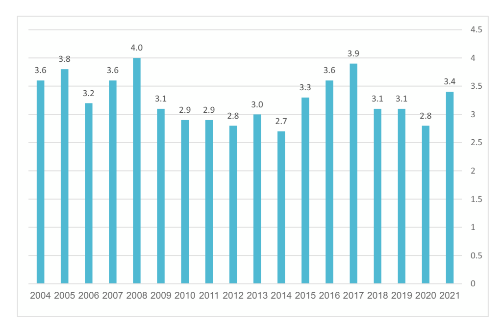
Figure 1 Distribution of tracheostomy during the study period.